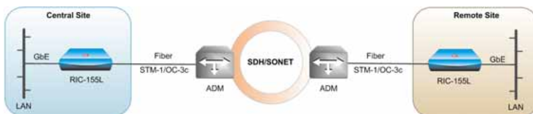
Figure 2. Point-to-Point Ethernet Private Line over SDH/SONET

Temperature: 0 to 50°C (32 to 122°F) Humidity: Up to 90%, non-condensing