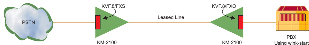
Figure 1. Direct Inward Dialing (DID) including Wink-Start with Reverse Polarity