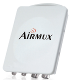
Airmux-Mobility Mobile Wireless Access