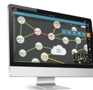
RADview Network Management and Orchestration