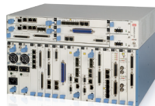
Megaplex-4 Next-Generation Multiservice Access Node